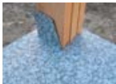
PRIOR TO INSTALL