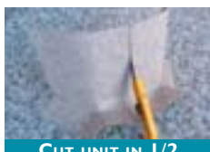
CUT UNIT IN 1/2 TO MAKE 2