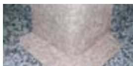
CUT UNIT PLACED