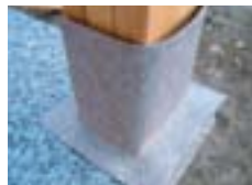
SECOND UNIT PLACED