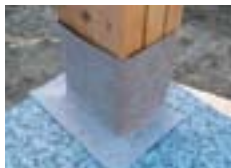
SINGLE UNIT PLACED