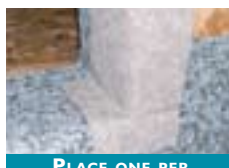
PLACE ONE PER SILL CORNER