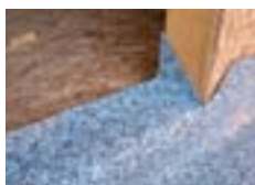
PRIOR TO INSTALL