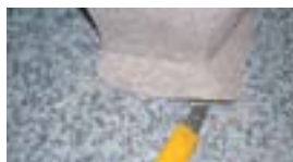
ROUND OFF CORNERS ON ALL APPLICATIONS FOR BETTER APPEARANCE